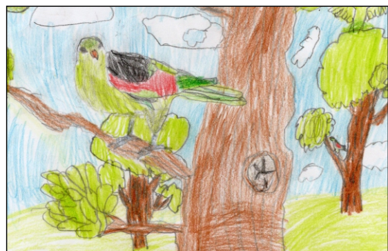
Red-winged Parrot By LEOPOLD 1924 finalist

Text EF to 0417 422 302 with your email address We will send you a copy of the Entry form, Prize List and conditions etc